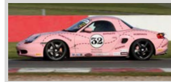
32 WILL HESLOP