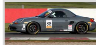
88 PAUL SIMPSON