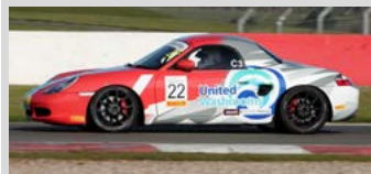
22 PETER EVANS