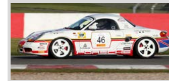
46 ASHLEY WHITE