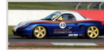
49 STEVEN SHORE