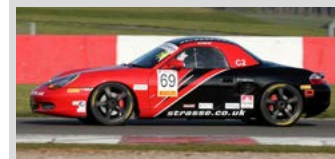
69 JON NEWALL