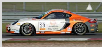
23 SIMON CLARK