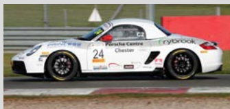
24 CARL HAZELTON