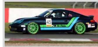
45 PAUL SEAGRAVE